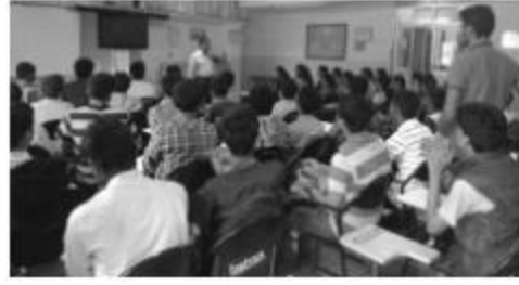
Need for Skill Development Read More