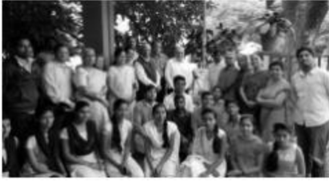
Creating Youth Leaders Read More